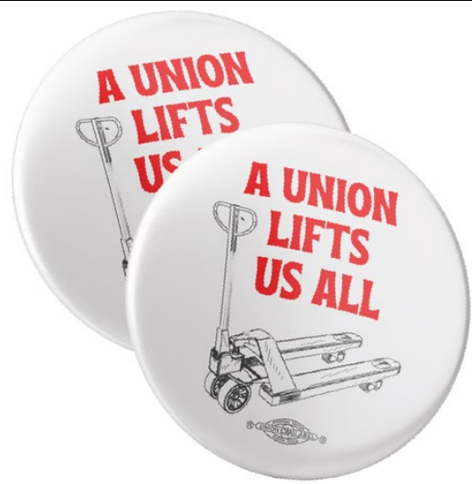
Product design: "Pallet Jack"