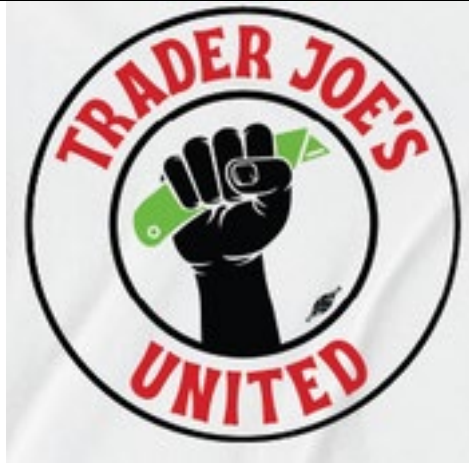
Product design: "Trader Joe's United"