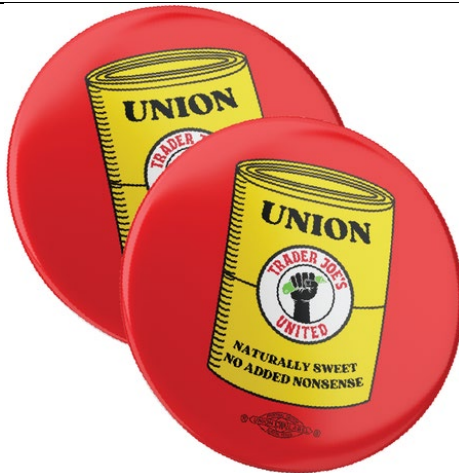
Product design: "Canned Corn"

29. For example, among other products, Defendant affixes its infringing product designs to reusable carrying bags. This infringes at least Trader Joe's Trademark Reg. No. 5,221,626, which covers "merchandise bags" in Class 16 and "[a]ll-purpose reusable carrying bags" in Class 18. A side-by-side comparison of Trader Joe's authentic product and Defendant's infringing product is shown below: