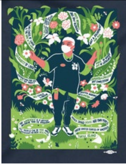
Product design: "Garland Wrapped With Pro-Union, Pro-Labor, Pro-Socialism Slogans"