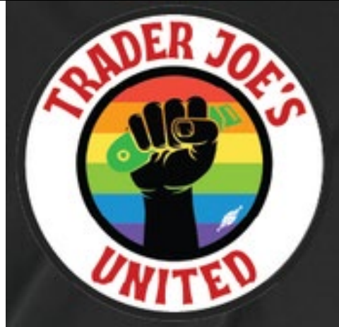
Product design: "TJU - Pride"